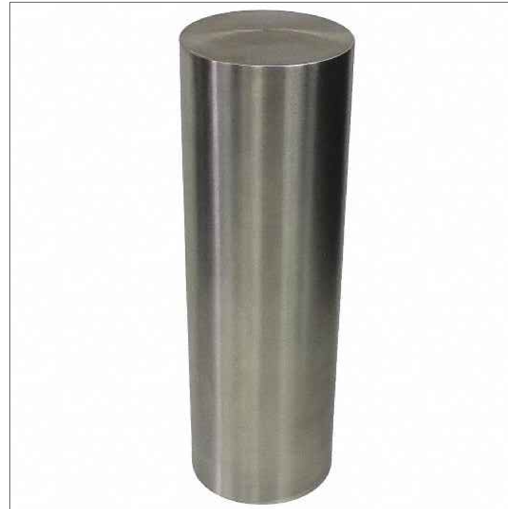
Stainless Steel Bollard Cover Product # SBC-1909-FL